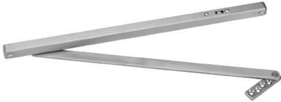
DTS 4400 series surface mounted door stay & holder